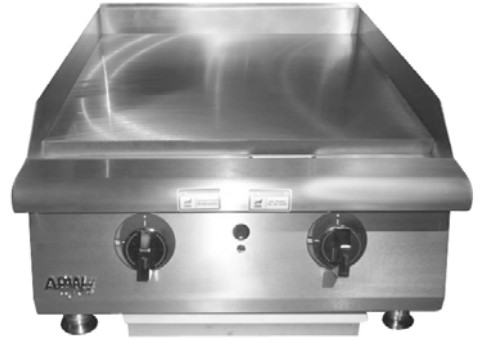
Model HMG-2424 Heavy Duty Manual Griddle

The interior combustion chamber is heavy-duty heat resistant 11-and 16-gauge steel, and is hand-welded for strength and durability. Standard features include stainless and aluminized steel exterior, spatula-width front grease trough, stainless steel landing ledge and large capacity, slide-out grease pan. Additional features include individual 3/4" NPT rear gas connection in natural or LP gas, pressure regulator and 4" (102mm) NSF approved legs with adjustable bullet feet. Stainless steel splash guards are continuously welded to the griddle plates.