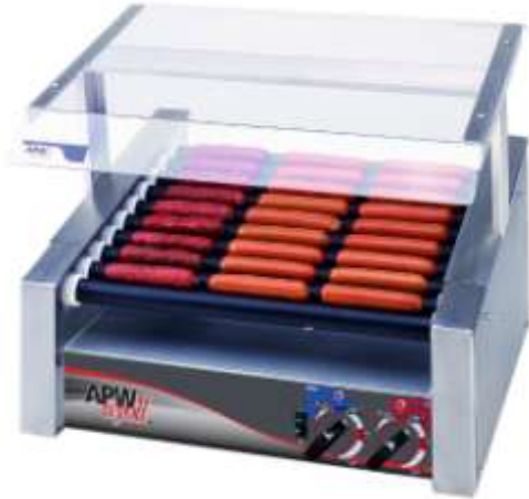
Model: HRS-31S Roller Grill with SGXP-31 Sneeze Guard