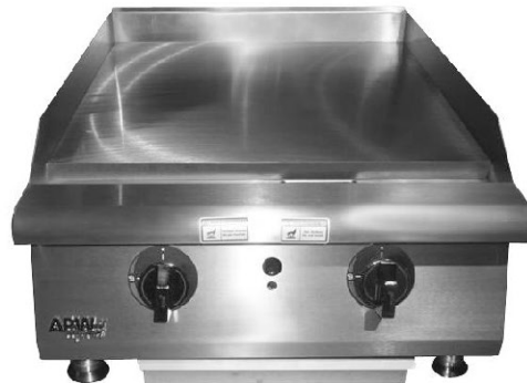
Model HTG-2424 Heavy Duty Thermostatic Griddle