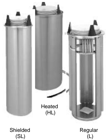
Model: Lowerator® Drop-In Dish Dispensers