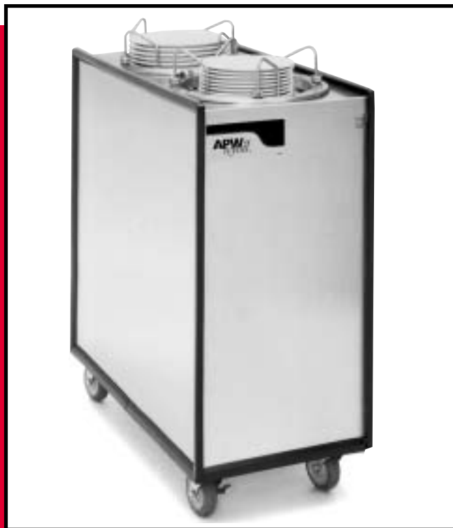
MODELS ML-A, HML-A Lowerator® Enclosed Mobile Adjustube® II Plate Dispensers