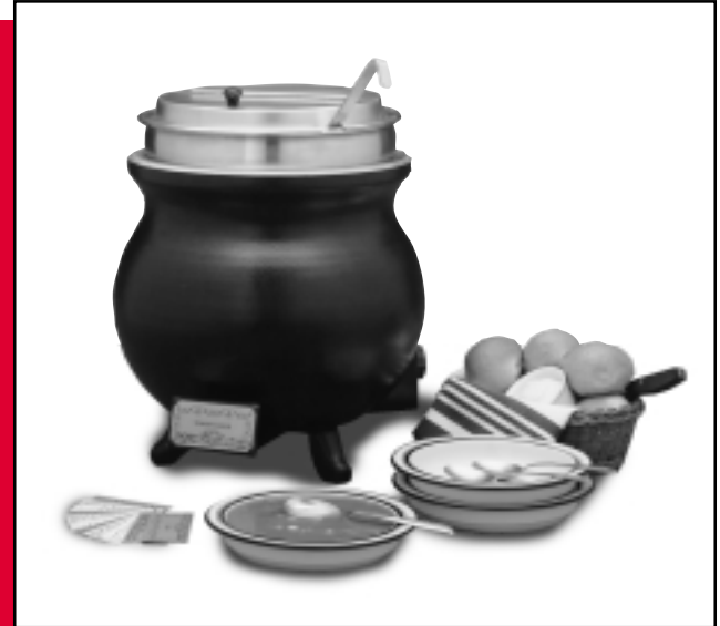
COUNTERTOP ROUND KETTLE SERVERS