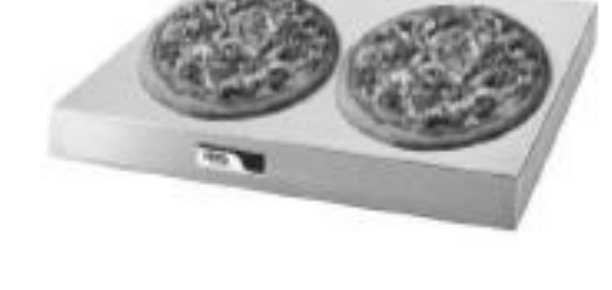
Model WS-3 Warming Shelf