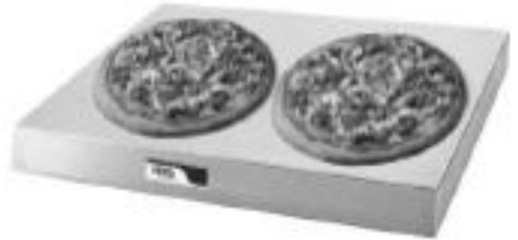
Model WS-3 Warming Shelf