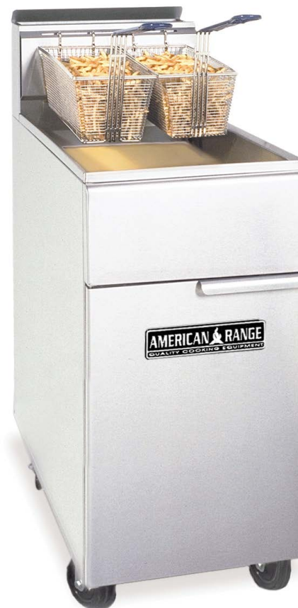
AF-35/50 Shown with optional casters