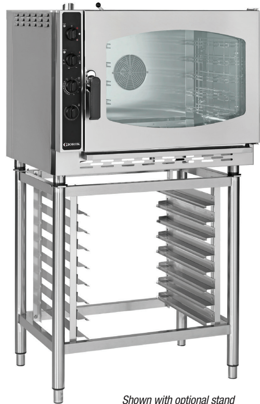
Shown with optional stand