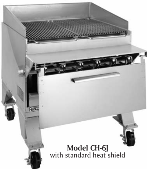
Model CH-6J with standard heat shield