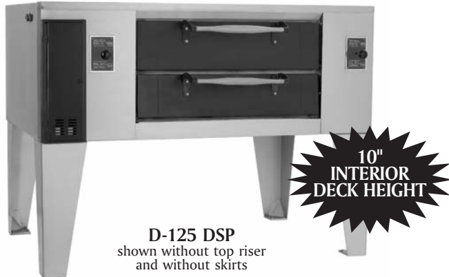
D-125 DSP shown without top riser and without skirts