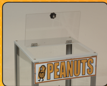
Top-loading for convenience