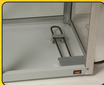
50 watt heating element