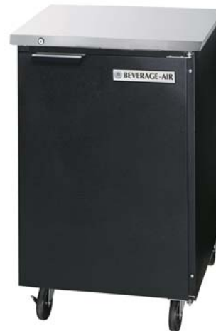
BB24 (black exterior with solid door shown)

NOTE: Unit standard on casters. It is not possible to order without casters.