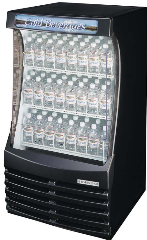
BZ13 shown with optional signage

The BZ13 is certified for bottled beverage and packaged food product