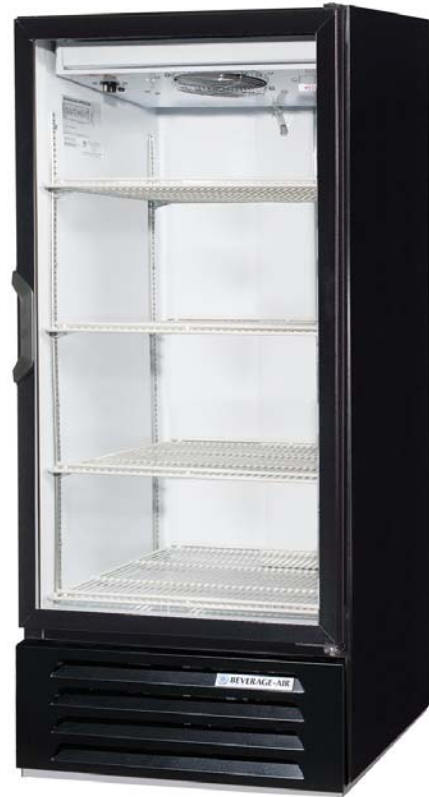
LV10-1-B (shown with optional fourth shelf)

MODELS: LV10-1-B LV10-1-W LV10-1-B-LED LV10-1-W-LED