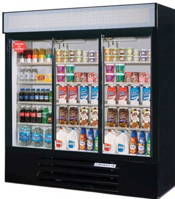
LV66Y-1-B (shown with 4 shelves per section)

MODEL: LV66Y-1-B LV66Y-1-W LV66Y-1-B-LED LV66Y-1-W-LED