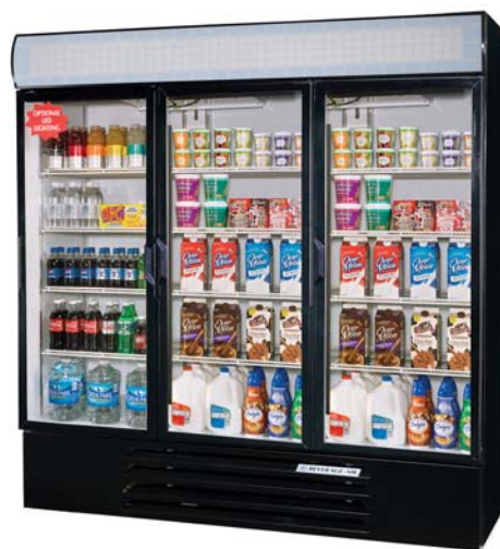
LV72Y-1-B (shown with 4 shelves per section)

MODEL: LV72Y-1-B LV72Y-1-W LV72Y-1-B-LED LV72Y-1-W-LED