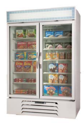
MMF44-1-W (SHOWN IN WHITE EXTERIOR) Black and S/S Exterior finishes available