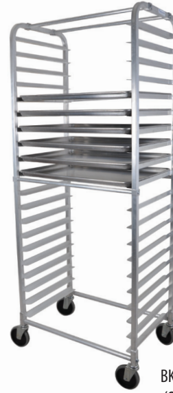
BK-ABPR-2S (Side Load)