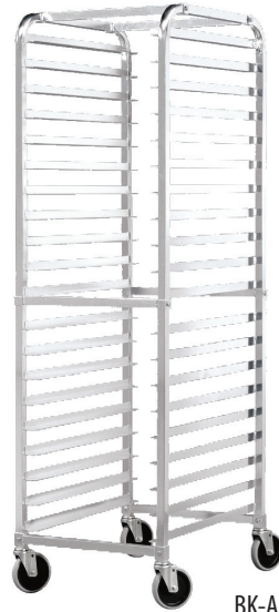
BK-ABPR-2 (Front Load)