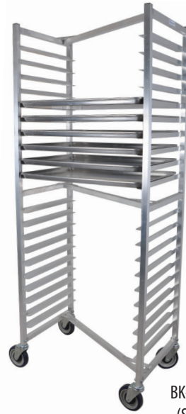
BK-ABPRZ-15 (Side Load)