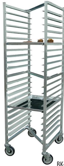
BK-ABPRZ-1 (Front Load)