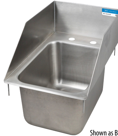
Shown as BK-DIS-1014-10-SS