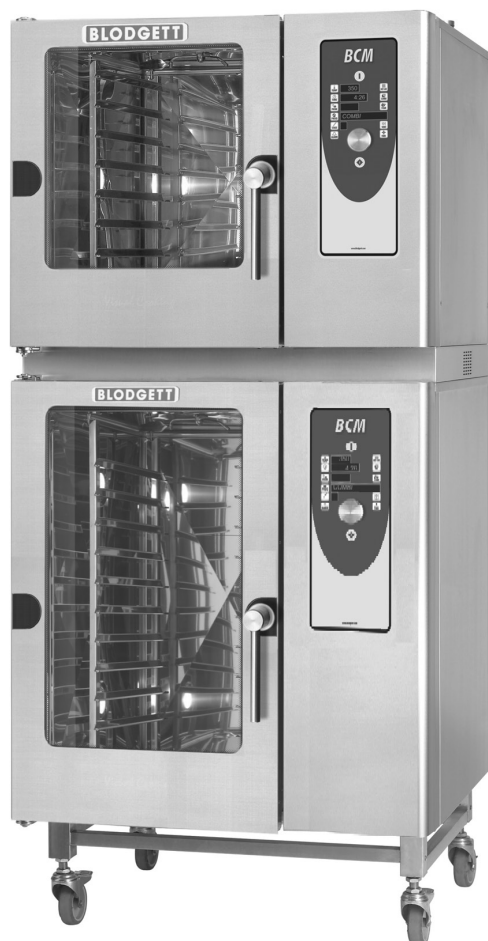
Shown with optional casters