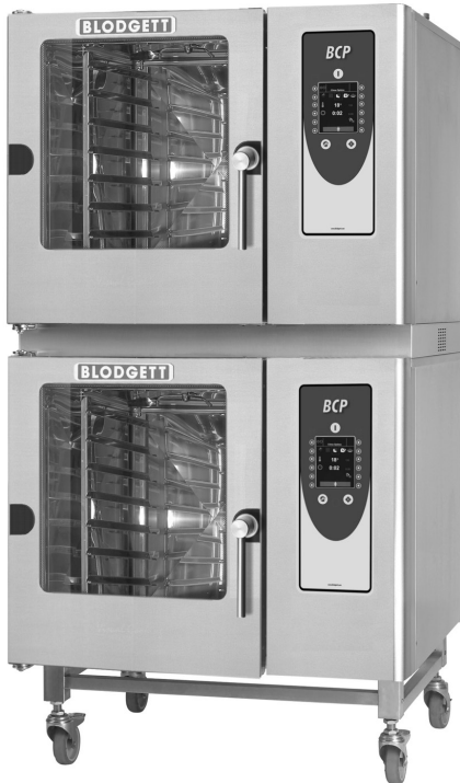
Shown with optional casters