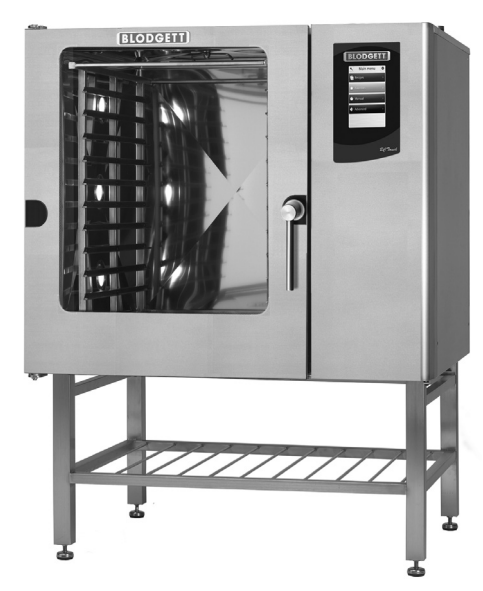
Shown on optional stand with shelf and adjustable feet

BCT-102E Single Electric Combination-Oven/Steamer with Touchscreen Control