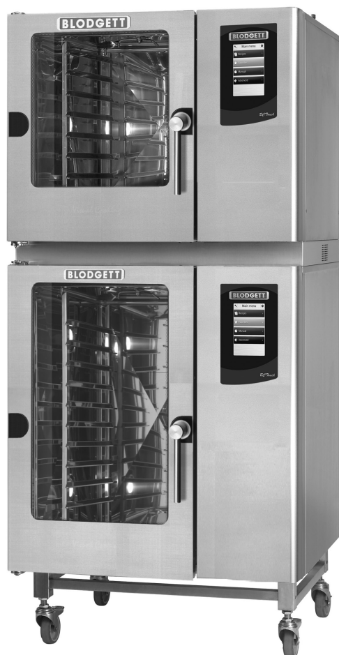
Shown on optional casters