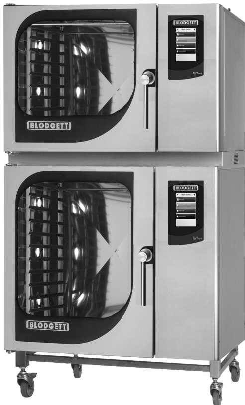
Shown on optional casters