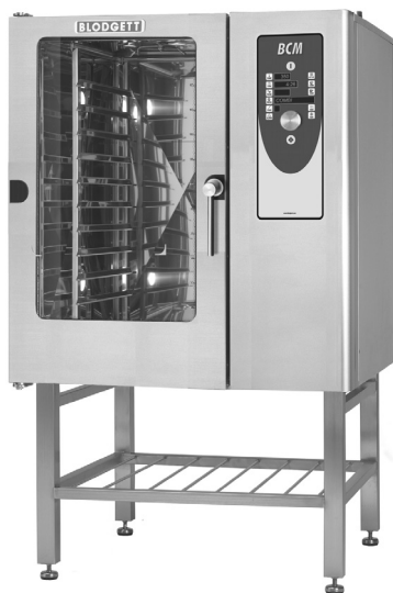
Shown on optional stand with shelf and adjustable feet