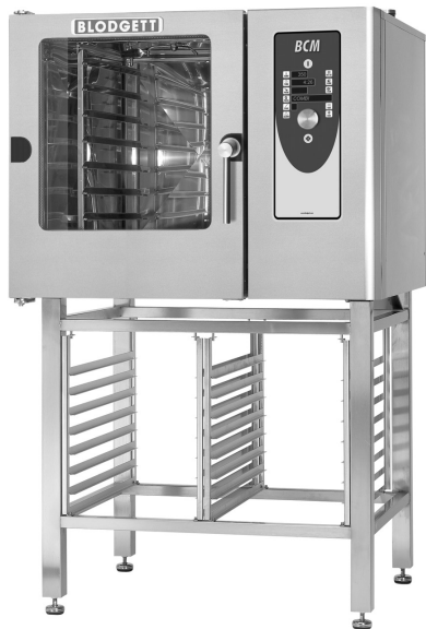
Shown on optional stand with runners and adjustable feet