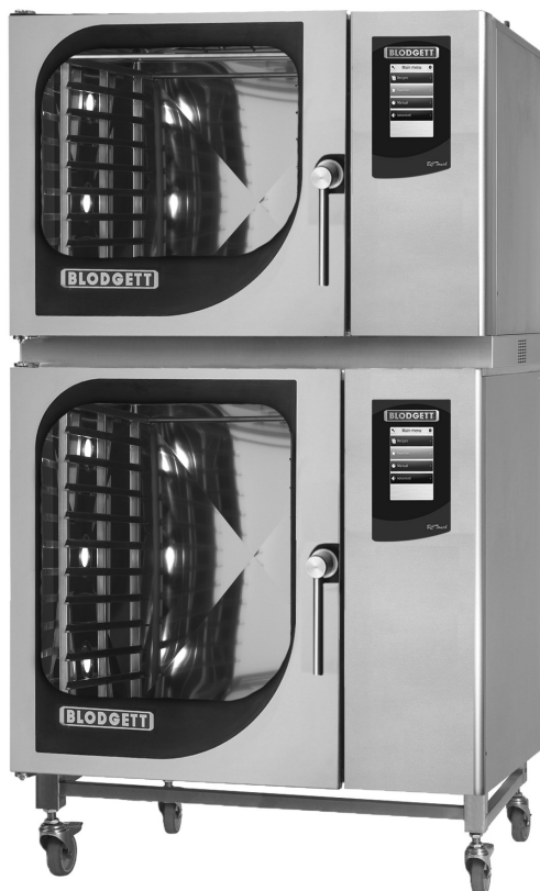
Shown on optional casters