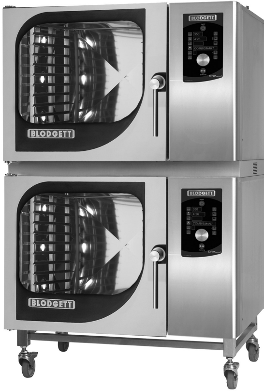
Shown on optional casters