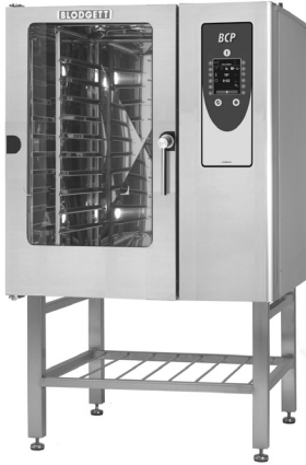
Shown on optional stand with shelf and adjustable feet