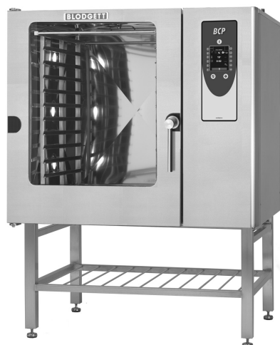
Shown on optional stand with shelf and adjustable feet