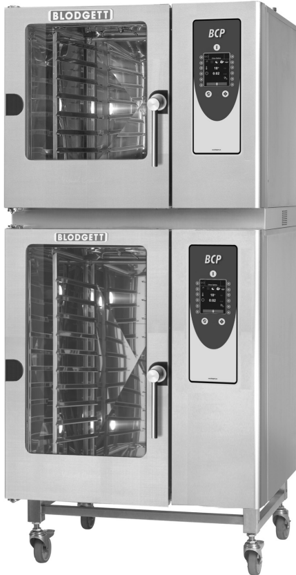
Shown on optional casters