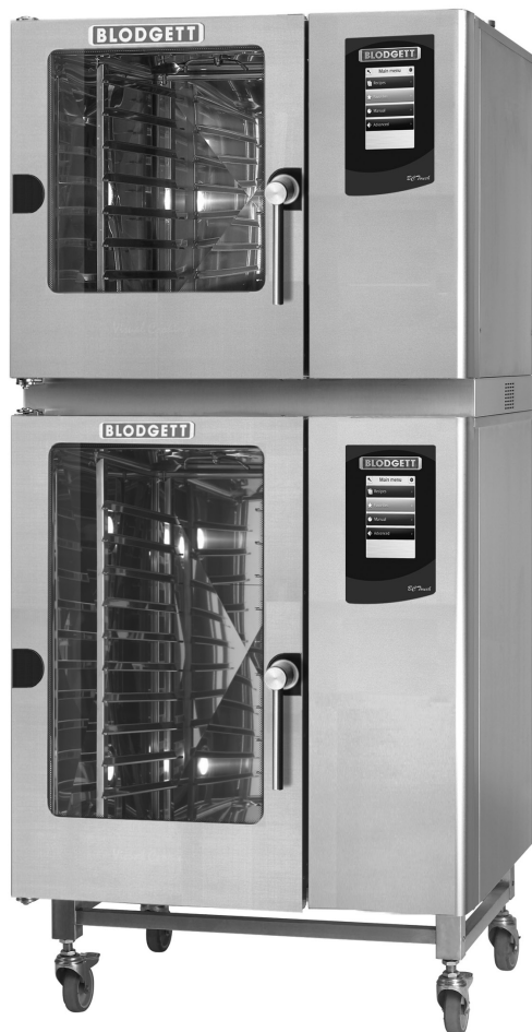
Shown on optional casters