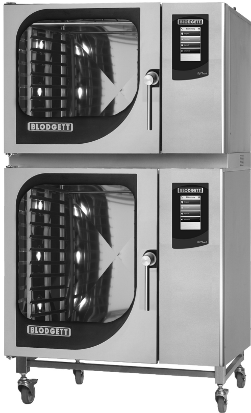
Shown on optional casters

Refer to operator manual specification chart for listed model names.