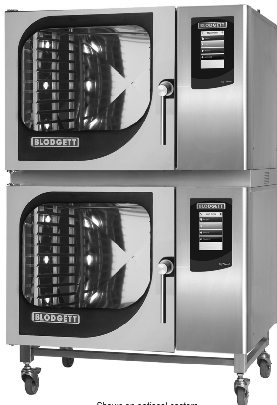
Shown on optional casters