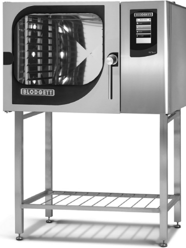
Shown on optional stand with wire rack and adjustable feet