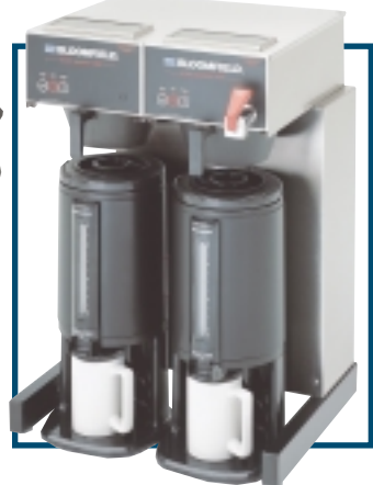
1090/1091 (with two optional 7750)