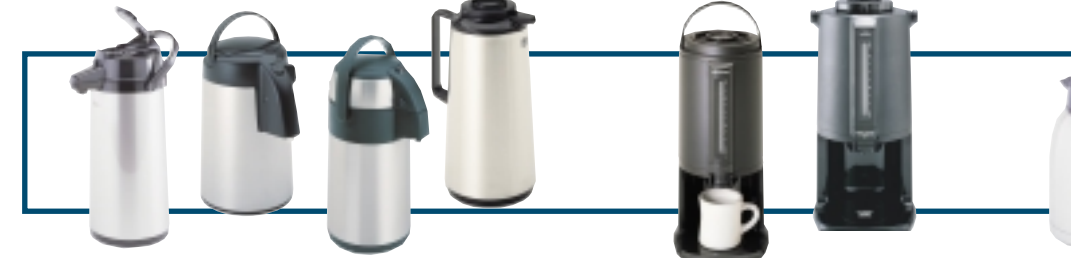
Complete line of Airpots

ACCESSORIES: See the Bloomfield Brew Brew product catalog for a complete listing of brewers and accessories.