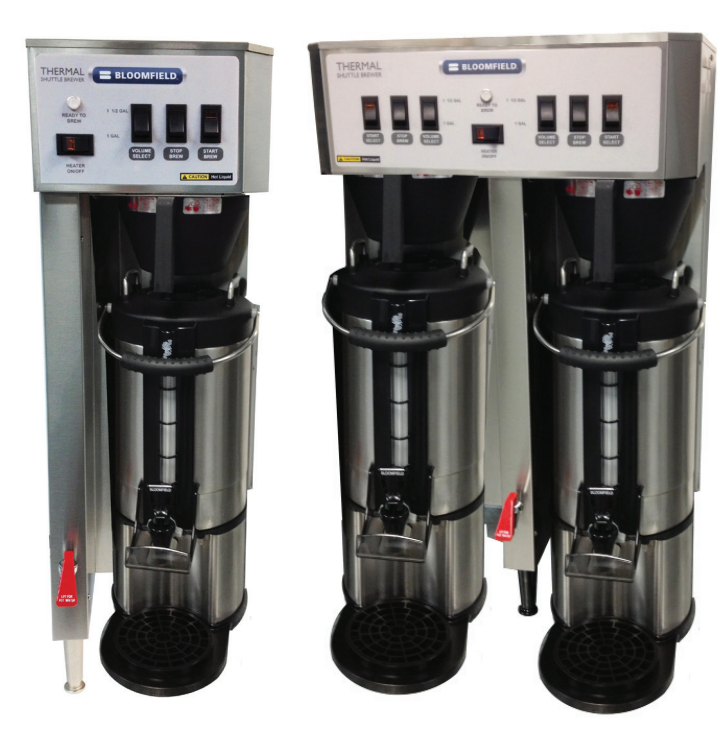
(Thermal servers sold separately - model 7757)