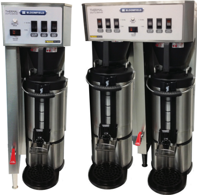
(Thermal servers sold separately - model 7757)