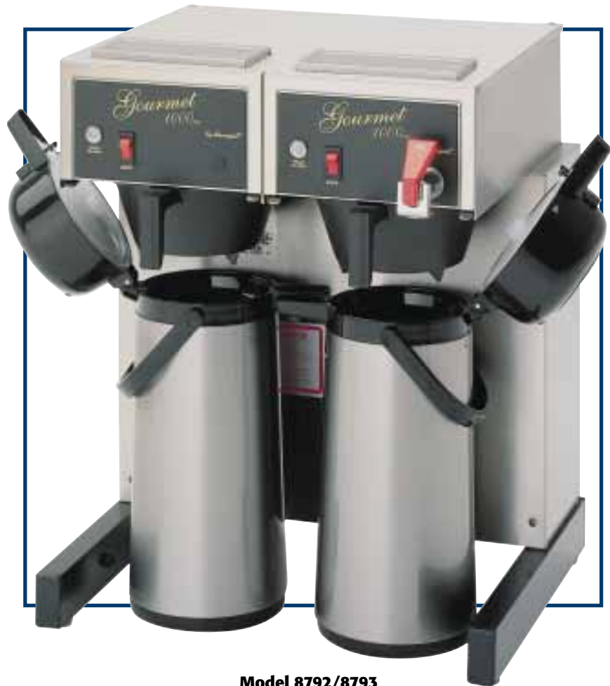
Model 8792/8793 shown with optional 7759