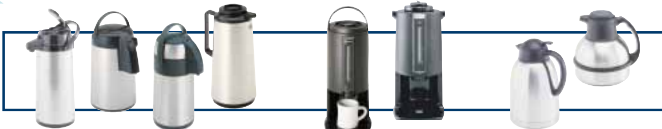
Complete line of Airpots for use with brewers with 13 3/8" clearance heights

ACCESSORIES: See the Bloomfield Brew Brew product catalog for a complete listing of brewers and accessories.