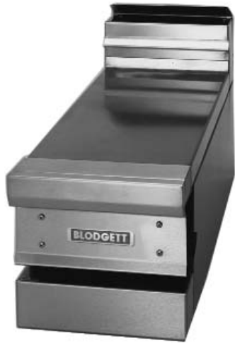
Shown without legs