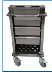
Handle Side view (all models): 3 drawers & bottom shelf