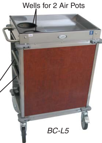
Wells for 2 Air Pots