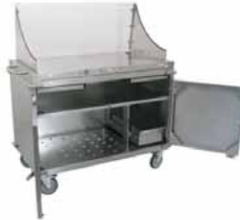
(CBC-DCX-SG-D BACK) w/ Security Doors & NO Buffet Server