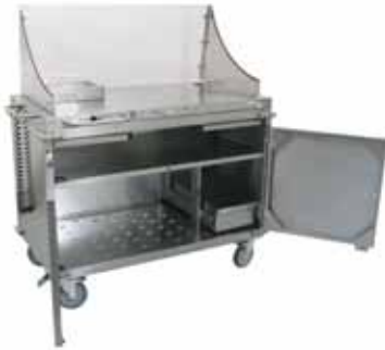
(CBC-DC-SG-D BACK) w/ Buffet Server & Security Doors