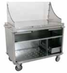
(CBC-DCX-SG-D BACK) w/ NO Security Doors & NO Buffet Server