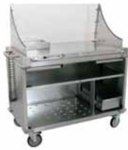
(CBC-DC-SG BACK) w/ Buffet Server & NO Security Doors