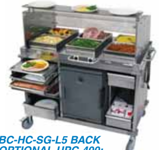
(CBC-HC-SG-L5 BACK w/ OPTIONAL UPC-400; lids not shown)