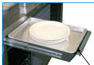
MobilServ® is a registered trademark of Cadco, Ltd.

Cart is open at back for easy access to drawers, shelves, and optional Cambro® Camcarrier®, Models UPC 400 or UPCH 400