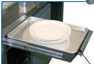
MobileServ® is a registered trademark of Cadco, Ltd.

Cart skirt is open at back for easy access to drawers, shelves, and optional Cambro® Camcarrier®, Models UPC 400 or UPCH 400