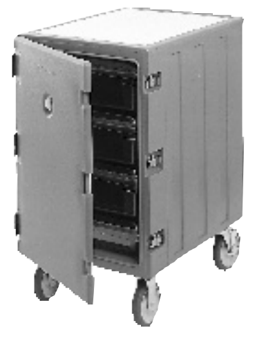
1826LBC (For Food Storage Boxes)