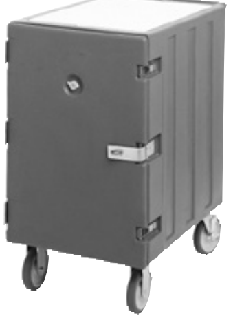
1826LBCSP (With Security Package)