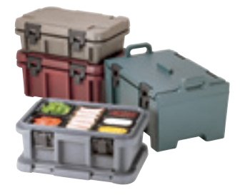
Top Loading Camcarriers <sup>®</sup> Top Loading Camcarriers safely transport hot or cold foods in full or fractional pans.