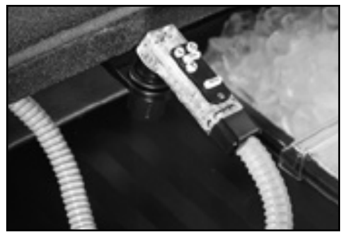
Premium quality 5-button, post-mix soda gun by Wunder-Bar* with fast, low foaming delivery. (shown on Cambar650DS model)