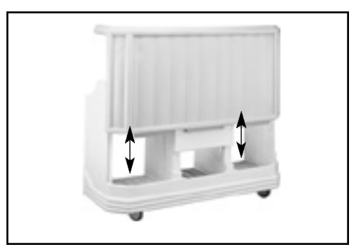
Detachable front for easy access to inventory and routing lines, tubes and hoses.